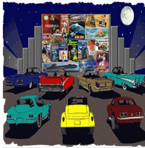
The IPMS USA 2018 Region Convention and Contest

SATURDAY AUGUST 11, 2018 SALEM CIVIC CENTER 1001 Roanoke Blvd. Salem, VA 24153 9am to 4pm