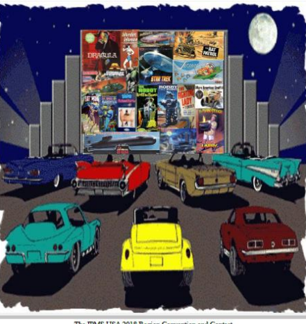
Spartanburg Scale Modelers "Back To The Bijou" September 14th-15th 2018

Remember to check the websites and/or chapter contact for up to the date info and details on the contests.