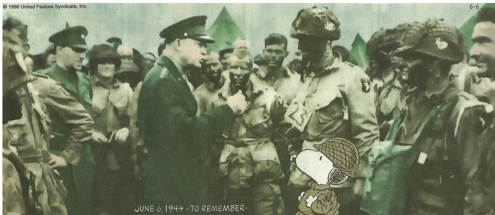
JUNE 6, 1944 - TO REMEMBER -