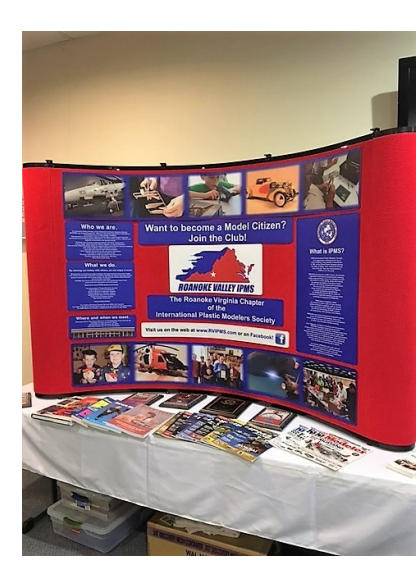
Club display at Scout Day Demo