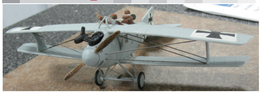
LFG Roland C.II The LFG Roland C.II, usually known as the Walfisch, was an advanced German reconnaissance aircraft of World War I. It was manufactured by Luft-Fahrzeug-Gesellschaft G.m.b.H. Wikipedia Top speed: 103 mph (165 km/h)

Wingspan: 34 feet (10 m) Length: 24' 8" (7.52 m)