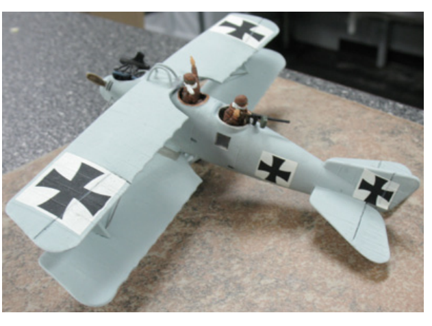
1/72 scale Airfix model by Terry Eastman

Manufacturer: Luft-Fahrzeug-Gesellschaft