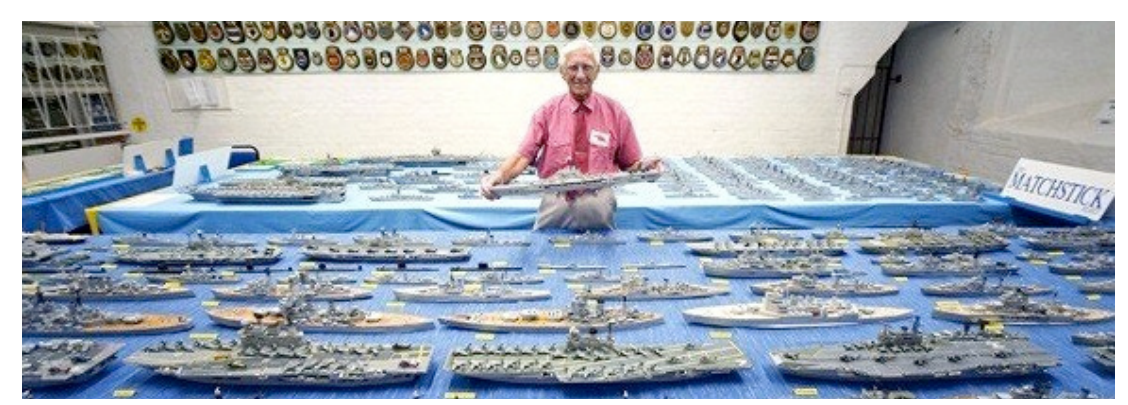
Visit www.scalemodelnews.com/ for more photos and story.