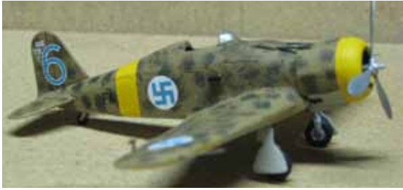
Fiat G. 50 Ilmavoimat, HLeLv 26 Lunkula, Finland August 1941