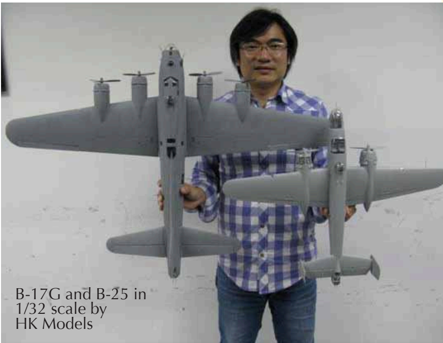
B-17G and B-25 in 1/32 scale by HK Models