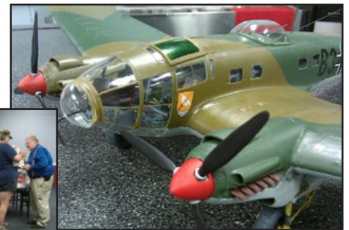
June Build Meeting...