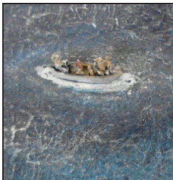
Can you see the fish?