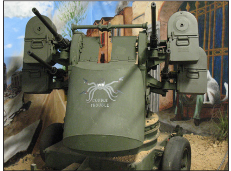
Nose art on an AA gun? Who's gonna argue with it?