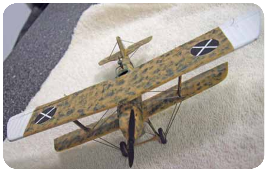
1/72 scale multimedia short-run model by Hitkit. Built by Terry Eastman