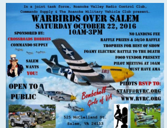
RC Show coming to Salem, VA