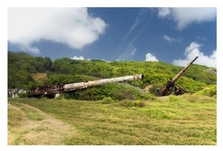
Remains of the space gun in Barbados