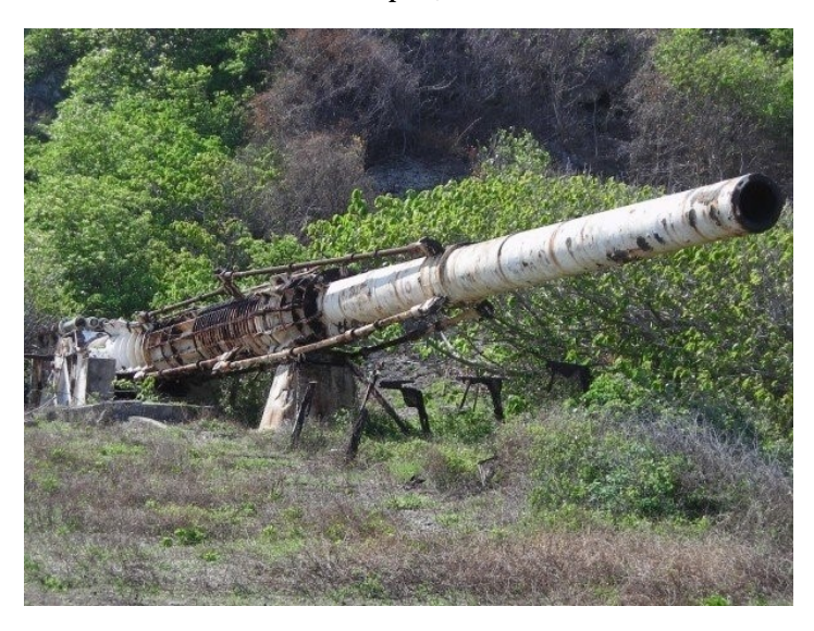
Project HARP Space Gun

Breaking through the Earth's atmosphere is not as easy as simply aiming a payload at space and shooting it like a bullet from a giant gun, but that doesn't mean we haven't tried.