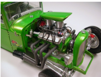
NNL Summer Classic Clemmons, NC.