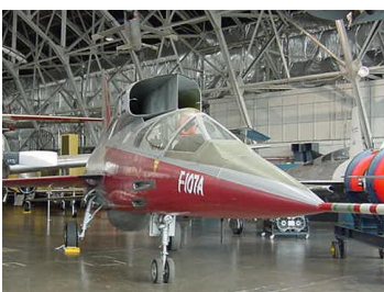
2009 National Convention Review