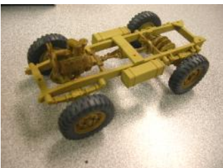
June Business and Build Meeting photos