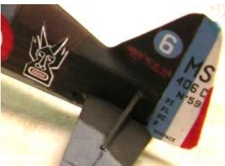
Terry Eastman's 1/72 Scale Morane Saulnier 406