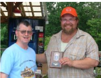
National D-Day Memorial "WWII in Miniature" Contest & Show