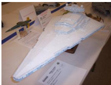
Northern Virginia Scale Modeler's Model Classic