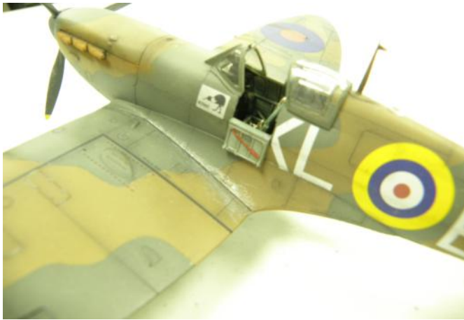
Cliff Young's Spitfire Mk. 1