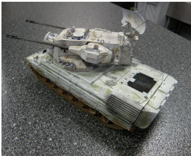
Mitch Cundiff's German Anti-Aircraft Tank