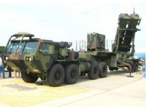
Patriot Missile Launcher