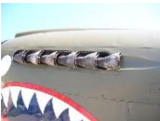
Joint Service Open House, Andrews AFB