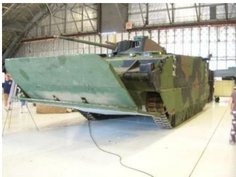
EFV - Expeditionary Fighting Vehicle