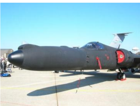
TR-1A Spy Plane (U-2)