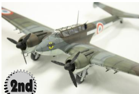
Cliff Young's Potez 631