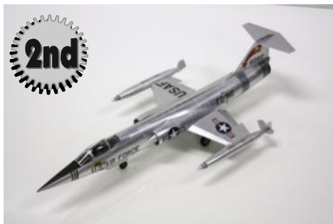
Mitch Cundiff's F-104 Starfighter