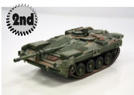
Mitch Cundiff's Swedish S Tank