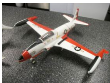
Club Contest Winners