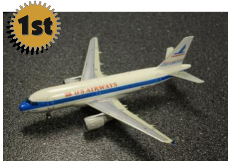
Tim Ward's Airbus Piedmont/US Airways A-319