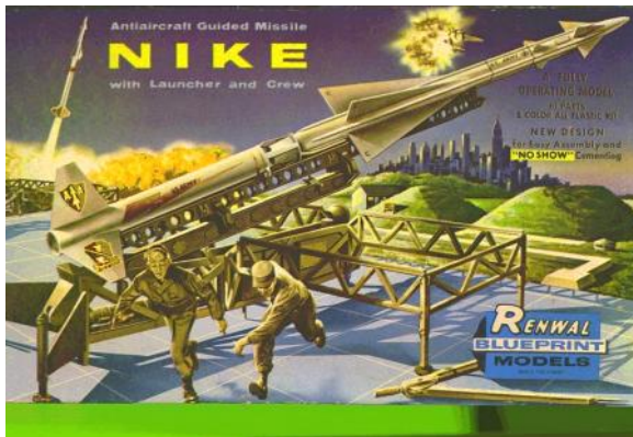
Blast from the Past