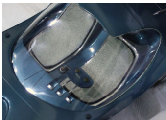
NNL East from Wayne, NJ