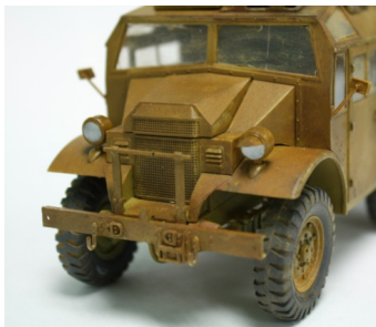
Devin's Field Gun & Quad Tractor Build