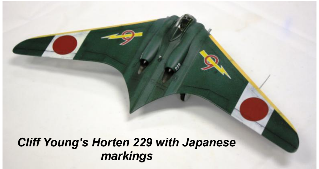
Cliff Young's Horten 229 with Japanese markings