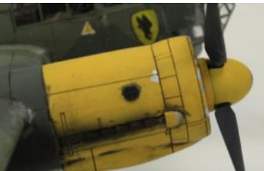
March Club Contest