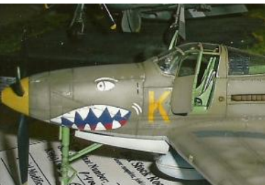
Box Stock Rock