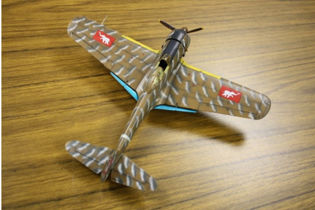
Cliff Young's first place winning Tai Air Force Oscar

Some of the pictures from our September Business Meeting