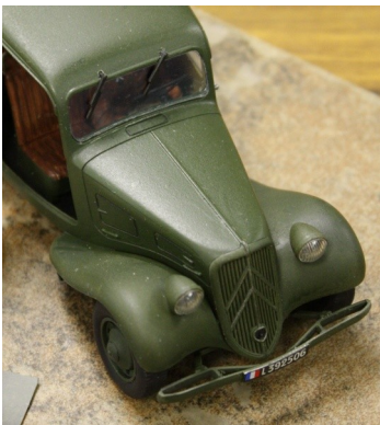
Terry Eastman's French Builds