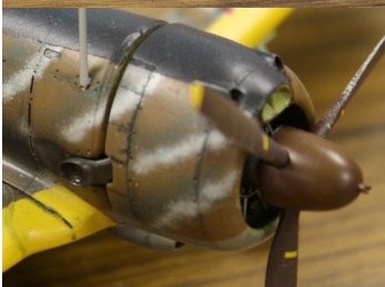
September Meeting and Contest