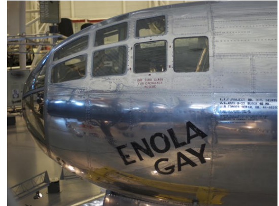
The Enola Gay on display at Udvar - Hazy

On Saturday September 26th Tim Ward and I traveled to Conover, North Carolina for the Foothills Plastic Pros, Fall Classic Model Contest and Swap Meet. It was a good show with more military items and much more diversity in kits and other goods for sale from the vendors than in past shows. The contest is still dominated by automotive subjects as this was a car only show just several years back. This was a "kill two birds with one stone" trip as we meet up with several members of the Gaston County Modelers to return the table cloths and display that they loaned us for the Region 2 convention in 2007. Bout time eh! They're looking at the possibility of having a show and contest in 2010 so we'll have to throw some extra support to the Gaston guys.