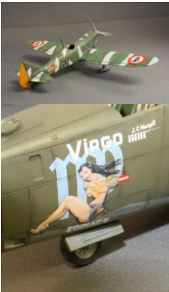
January Build Meeting